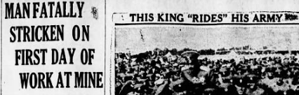
THIS KING "RIDES" HIS ARMY

Contrary to reports of army dissatisfaction with King Boris' rule in Bulgaria, this new photo indicates that he is popular with officers. He is seen being carried on shoulders while throng of military men cheers.